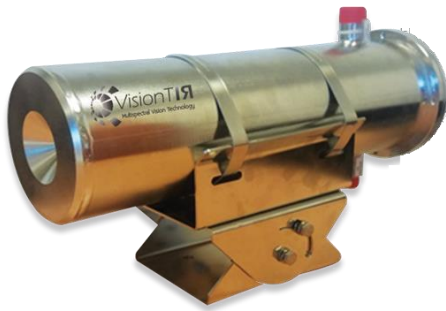
Rugged housing ProTIR made of stainless steel