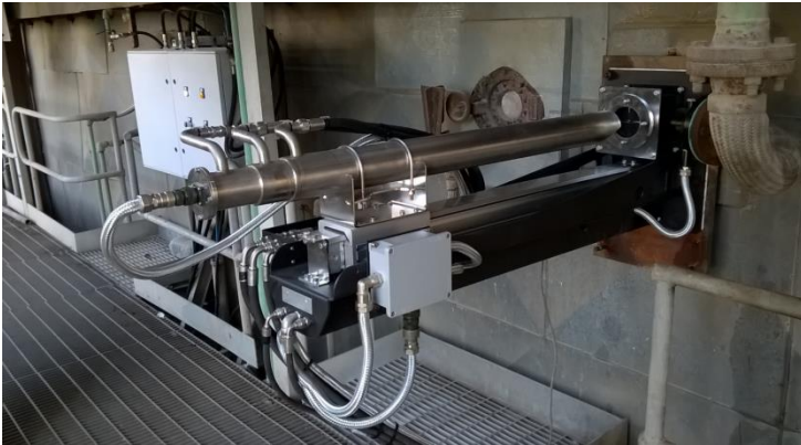
ProTIR retractable system in reheating furnace