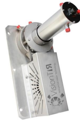
Wall fixing mechanism